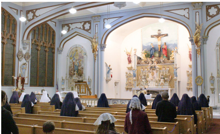
In accordance with a decree of Pope Leo XIII, the Sisters and parishioners recited the Rosary in the presence of the Blessed Sacrament exposed daily throughout the month of October.

"Night shall be thrice night over you, And heaven an iron cope. Do you have joy without a cause, Yea, faith without a hope?"