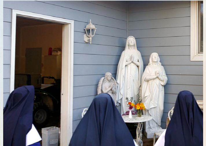
On the 100th anniversary of the blessing of Lourdes Grotto at Mount St. Michael, the Sisters at MIQ Parish made a "pilgrimage" to the original statue to pray the Rosary. After the statue was vandalized in 2009, and the missing pieces found, a parishioner at MIQ Parish restored it, and now lovingly keeps it to await a new grotto of its own.