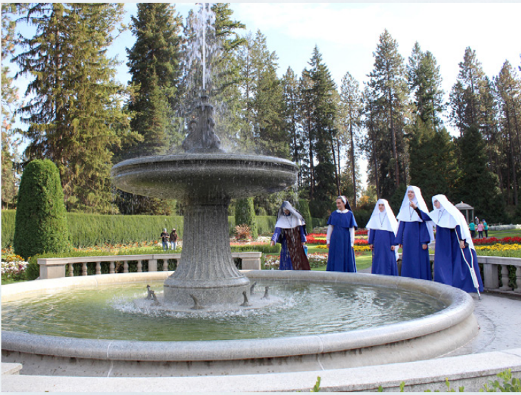
The novitiate Sisters admire the fountain in Duncan Garden during an afternoon outing to Manito Park in early October.