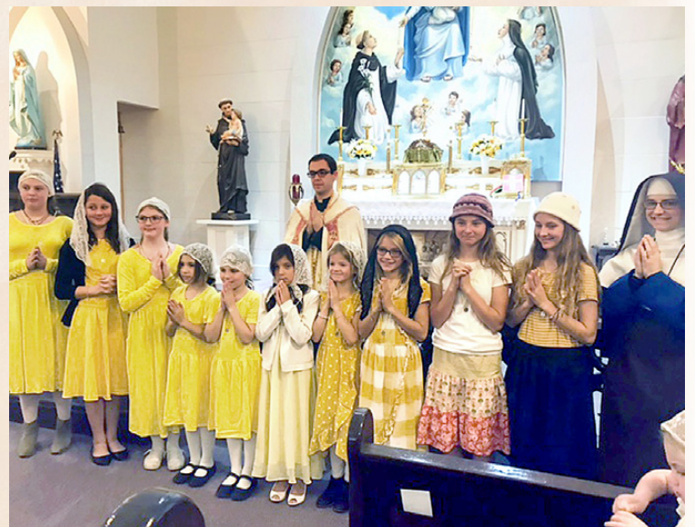
Girls of Most Holy Rosary Church (Middleville, Michigan) were excited to take part in the first Children of Mary Sodality advancement ceremony in their parish.