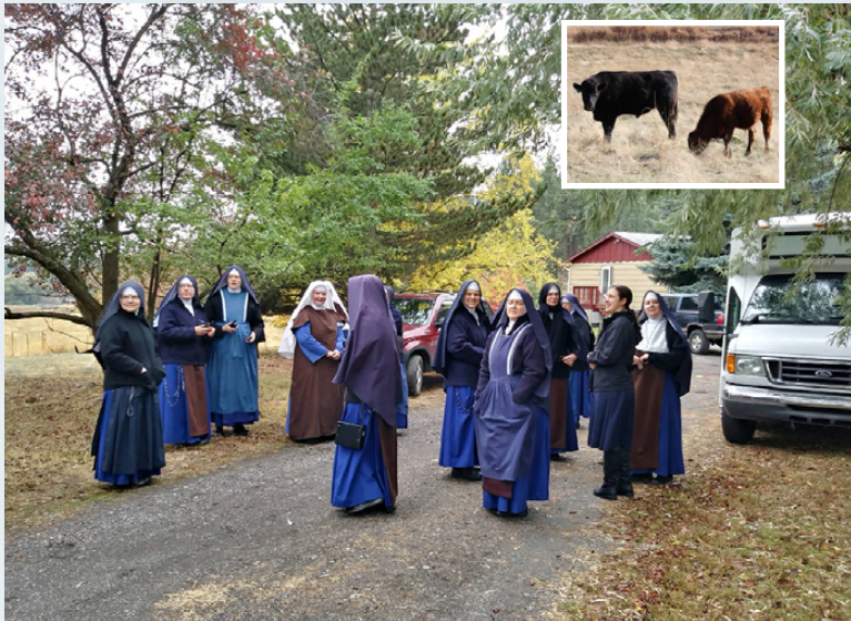
Sisters and volunteers gather at the novitiate for instructions before searching the area for our two steers that went missing. The hunt was unsuccessful, but the fugitives (Buddy and Clyde — see inset) were finally located a week later several miles away.