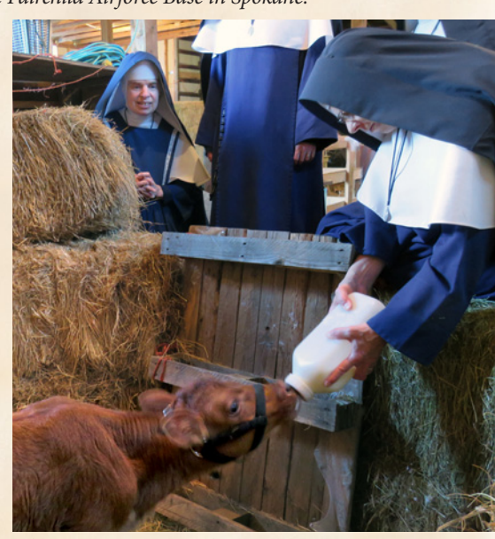
The Novitiate's calf, Thora, was cared for by the older Sisters while they were away on their outing.