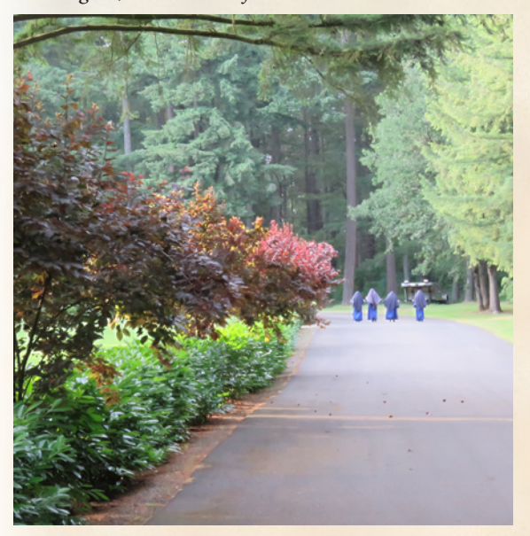
Marymount's manicured lawns and peaceful atmosphere were perfect for meditative strolls.