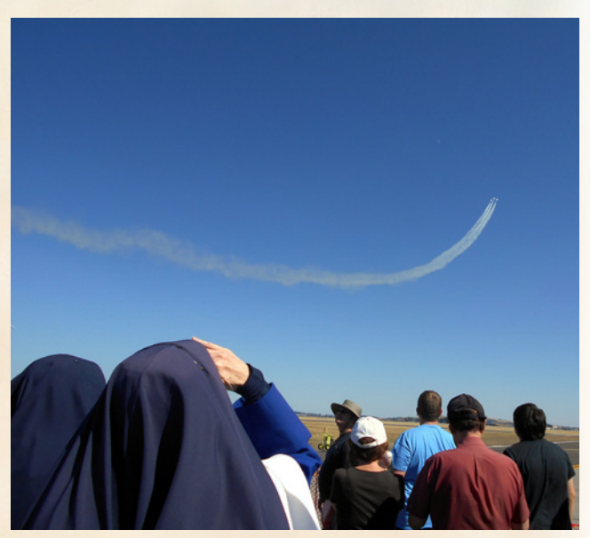
Every summer the Sisters have the opportunity to attend the airshow at Fairchild Airforce Base in Spokane.