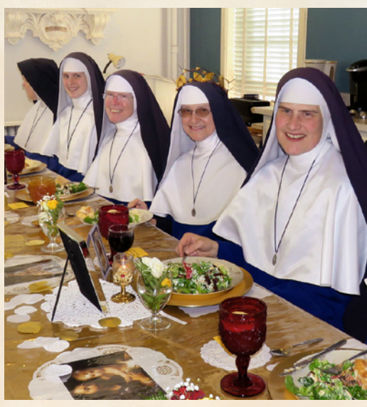
vow crown are replaced with those of gold.