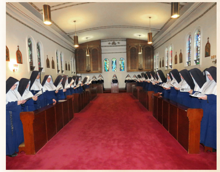
The Sisters chant Compline from the Divine Office in the Dominican choir stalls. How providential that the present owners, at the request of the Dominicans, left the chapel intact!