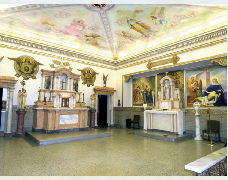
The original chapel with two altars and beautiful murals on the ceiling were available for our use. One altar faces the Sisters' choir, the other the boys' chapel.