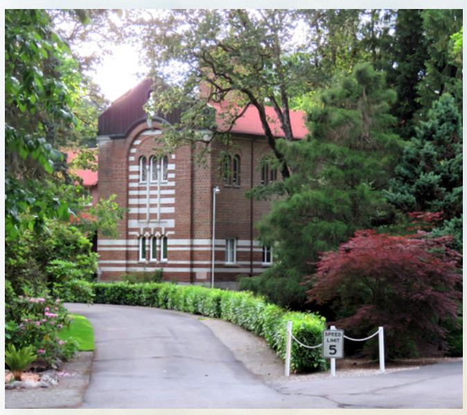
Marymount, an old Dominican military academy in Tacoma, Washington, was the site of the Sisters' annual retreat.