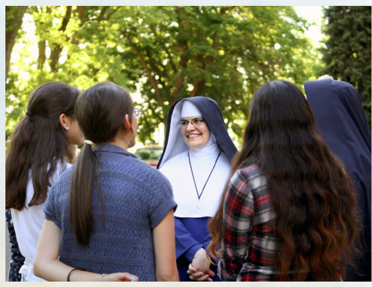
have a little chat with Sister.