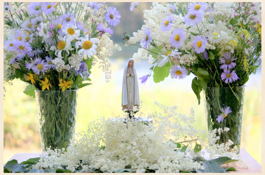
The Sisters weren't home on July 13th to join the downtown Rosary procession, so they improvised a shrine with wildflowers and prayed the 15 decades.