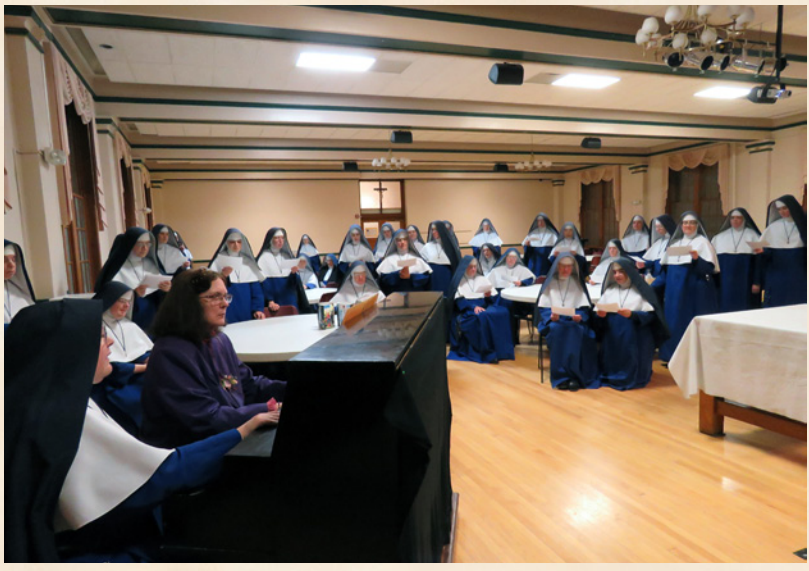
The celebration wouldn't be complete without a little music! The Sisters learned to sing a prayer familiar to them, "I am in Thy Hands, O Mary" for the occasion.