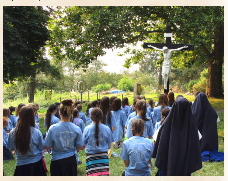
On the first day of Camp St. Philomena, the girls and the Sisters prayed the Rosary by the outdoor crucifix at Mount St. Michael.