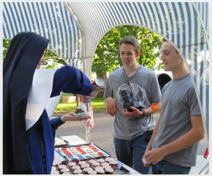
The 4th of July Singing Nuns' concert and dessert social is one of the School may be out for the summer, but that is no reason not to stop by and highlights of our summer.