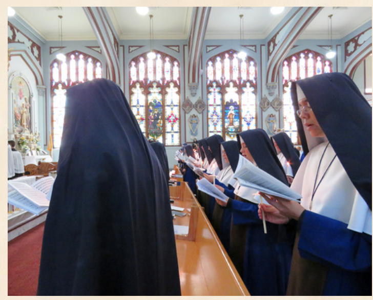
As members of the same religious family, the Sisters join the various hymns and chants throughout the vows' ceremonies.