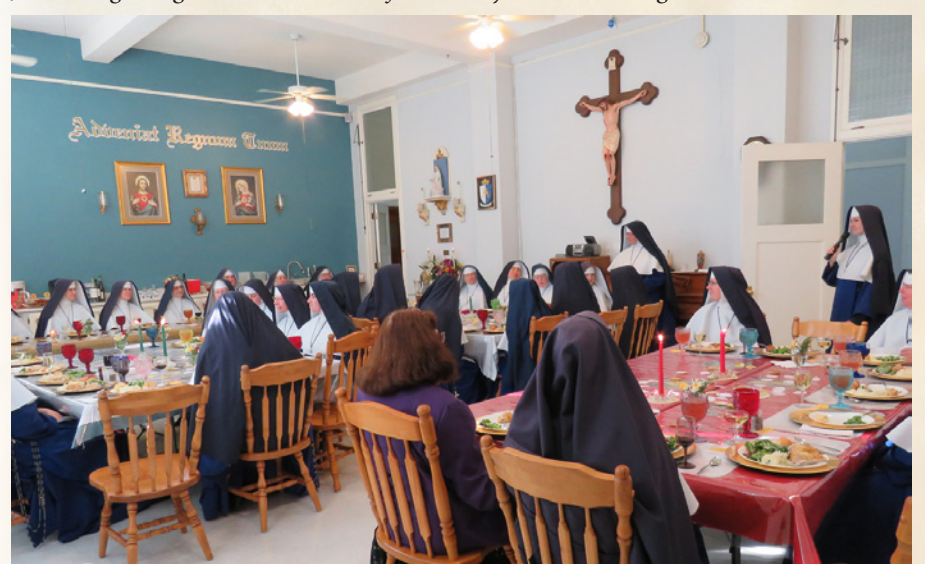
A special meal to honor the occasion was accompanied by toasts given by three Sisters, one to At the golden jubilee, the green leaves on the final represent the younger, the middle and the older generations of our Congregation.