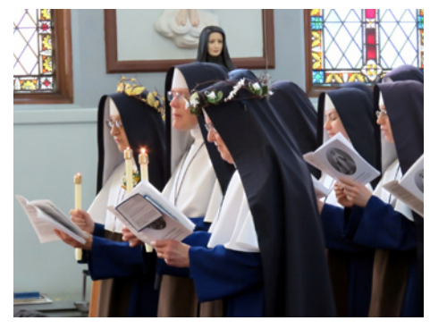
The Sisters' vow ceremony closed with the chanting of the Te Deum , the Church's hymn of thanksgiving.

In Jesus and Mary, The Sisters of Mary Immaculate Queen