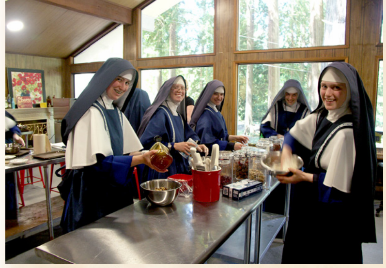
Easy on the honey, Sister. During their outing to Tacoma, the junior Sisters enjoyed flavoring cheese during a class at River Valley Cheese, Issaquah, Washington.