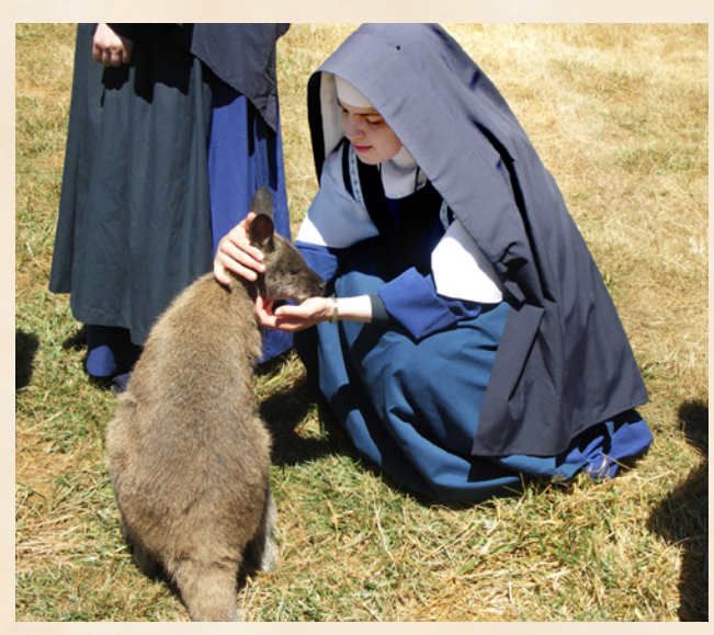
Why, it's a wallaby! A complimentary tour of Fall City Wallaby Ranch turned out to be a most enjoyable educational adventure.