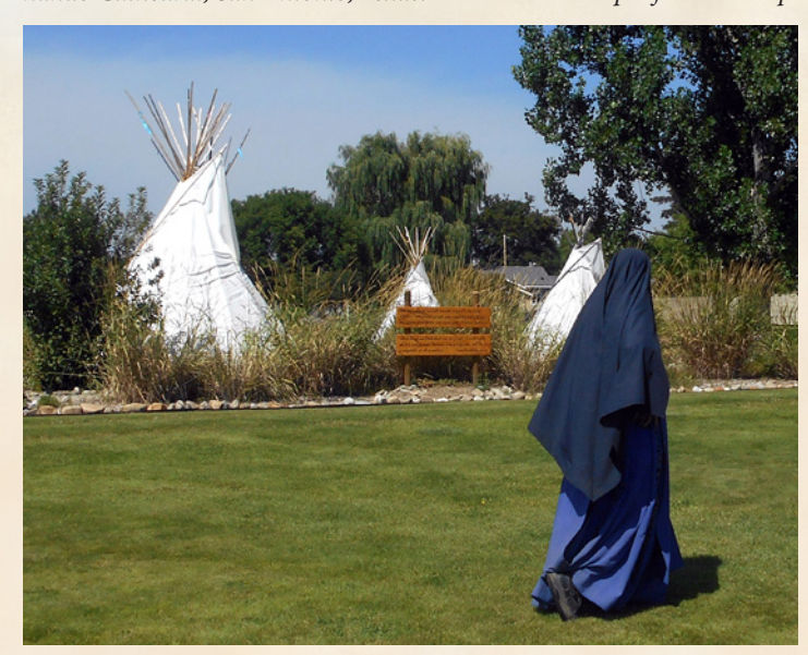
Several Sisters spent a few days visiting the missions in Montana. These teepees would have been a familiar site to the early missionaries.