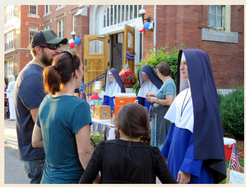
American patriotism, a tour of the Mount, some refreshments, a little chat with Sister—there is so much to enjoy at our summer concerts!