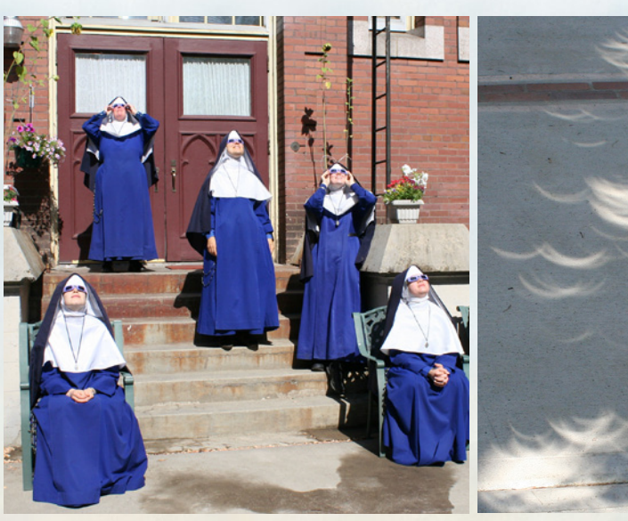
It's a bird! It's a plane! No, it's a solar eclipse! Sporting some special eclipse glasses, the Sisters took a little time to watch one of nature's marvels. Through little holes in the leaves, the shadow of the eclipse formed unique patterns on the sidewalk.