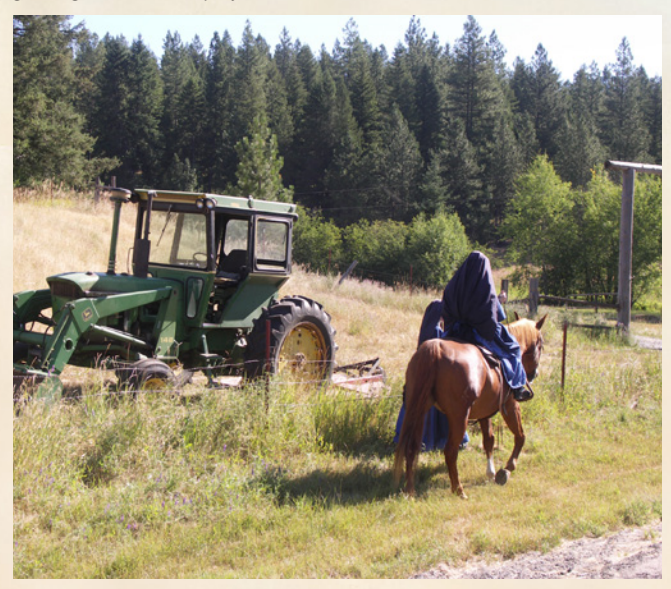
The junior Sisters spent a few peaceful days enjoying the beauty of northern Washington at Brookside Acres. Their visit included a short trail ride.