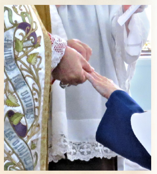
At perpetual profession, each Sister receives a gold ring, her daily reminder of her espousals to Christ.