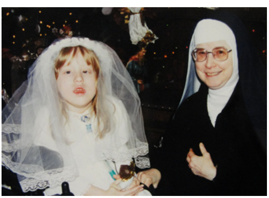
Sister shared a special understanding with her pupil whom she prepared to received Jesus for the first time.

or brethren, or sisters, or father, or mother, or lands for my sake shall receive a hundredfold, and shall possess life everlasting." And we are certain that God keeps His promises.