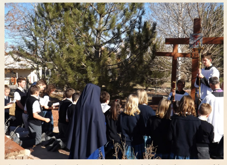
The students at Holy Guardian Angels Academy include the outdoor Stations of the Cross among their Lenten observances.