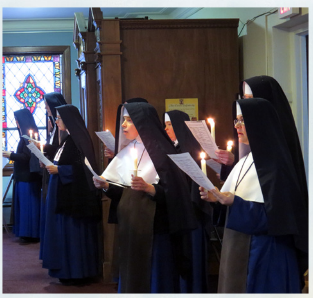
"A light of revelation to the gentiles." The Sisters chant while waiting to join in the Candlemas day procession.