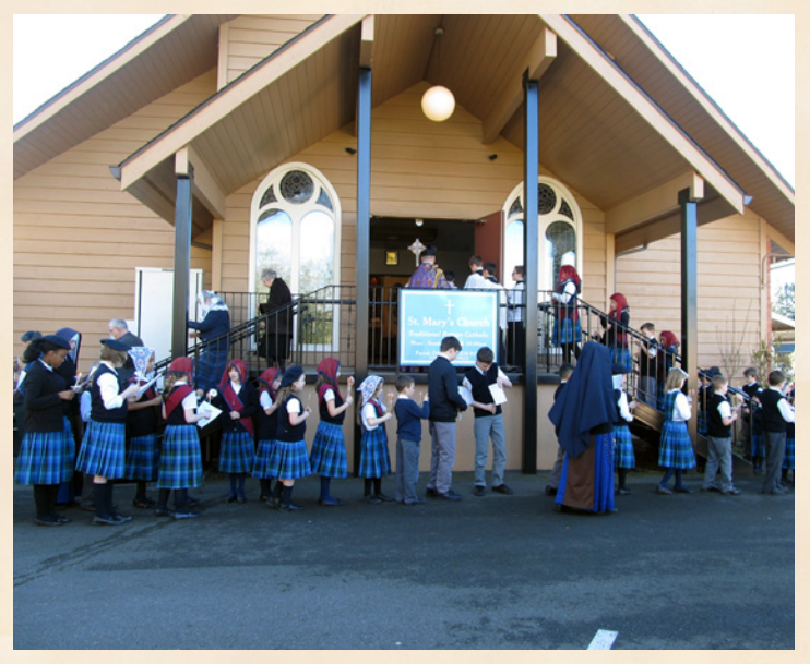
The staff, sodality and students of St. Mary's Academy in Tacoma join parishioners in a procession on the feast of Our Lady's Purification.