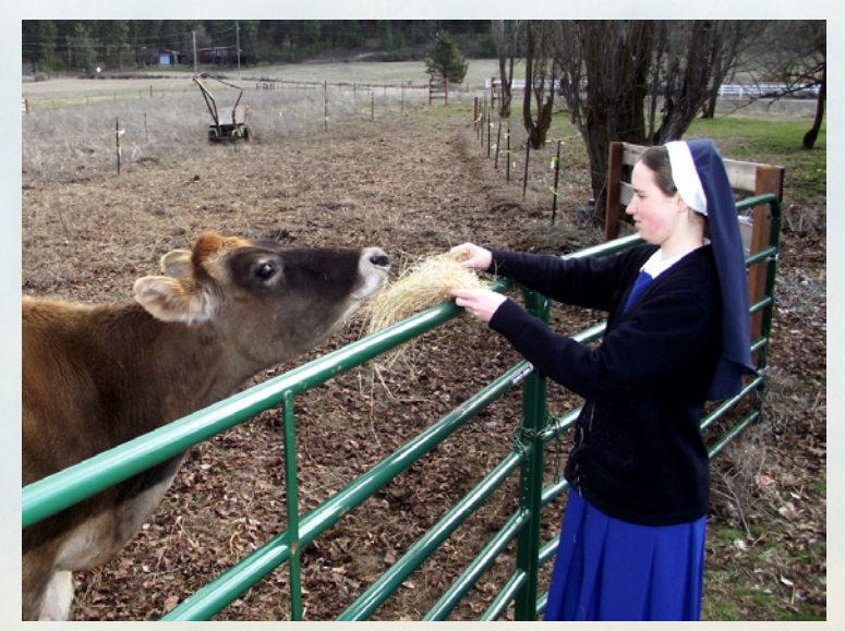
Meet "Lily," the Novitiate's new milk cow! Isn't it fitting that she came with the name of the emblem of good St. Joseph, who has done so much for the farm?