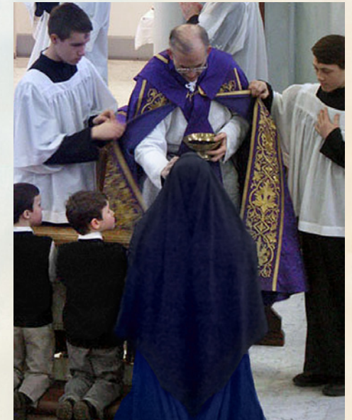
ceives ashes on Ash Wednesday.