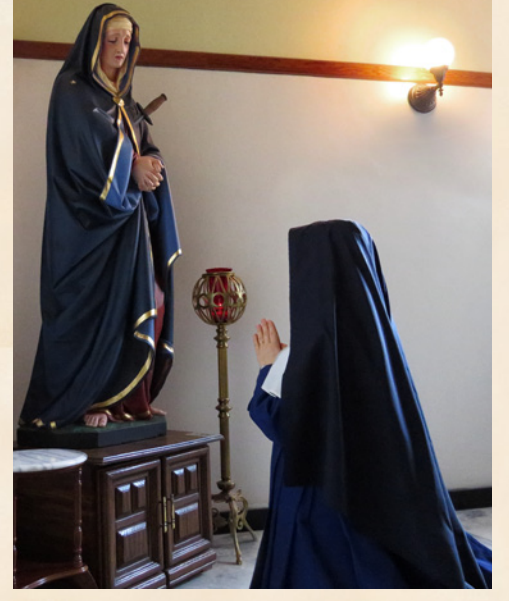
A young student watches as his Sister-teacher re- A Sister takes a break in her busy day to make a Lenten visit at the shrine of Our Mother of Sorrows.