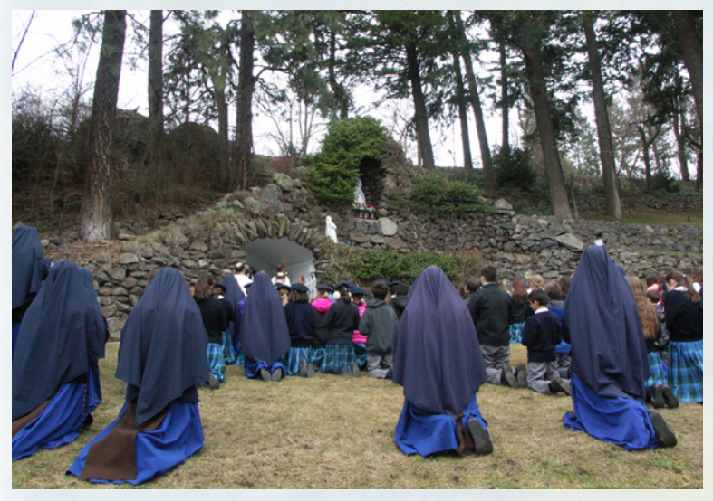
The Sisters joined the staff and students of St. Michael's Academy in a rosary procession to the Lourdes' grotto at Mt. St. Michael on February 11.